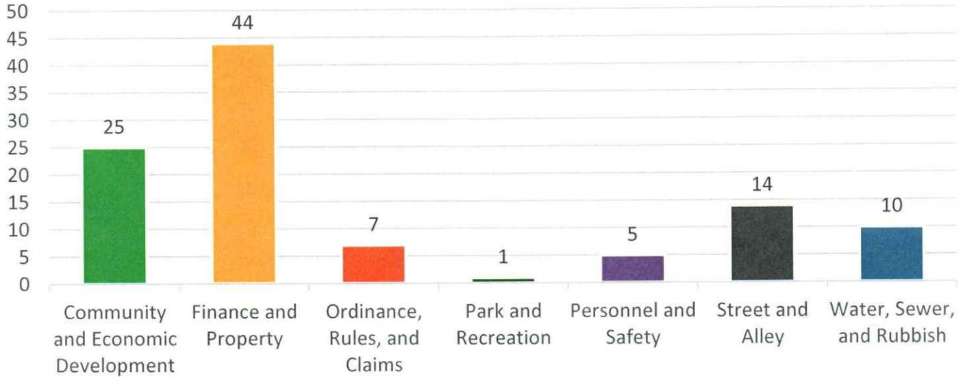
Figure 2: Legislation in Council by Originating Committee